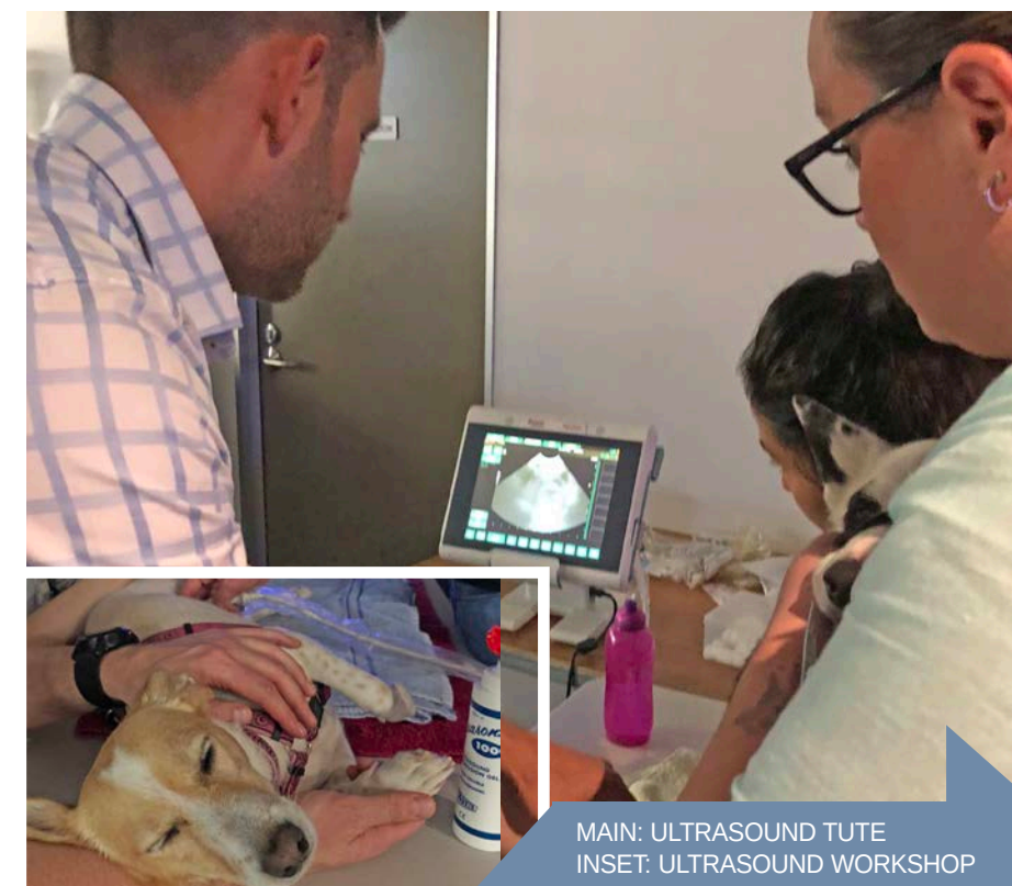
MAIN: ULTRASOUND TUTE INSET: ULTRASOUND WORKSHOP

The Chapter hopes to deliver a level of excellence in 2020 that is consistent with our current standards and member expectations, making it accessible and relevant to all of our current and future candidates.